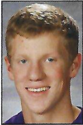
Van De Brake